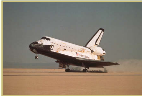
FIGURE 4 —Planning and building this space shuttle required the creation of thousands of separate drawings.

Many complex mathematical calculations are necessary to place a satellite in orbit. Many sciences are also involved. But nothing actually happens until the hardware is designed and produced. Building a helicopter, plane, satellite, or spacecraft requires separate drawings for thousands of parts. In order to function properly, some of these parts must be precision-made with exceptional accuracy. For example, consider the space shuttle shown in Figure 4 . All the parts of this craft must function reliably to ensure a successful mission into space. Each system and each component had to be drawn in great detail before this shuttle was built.