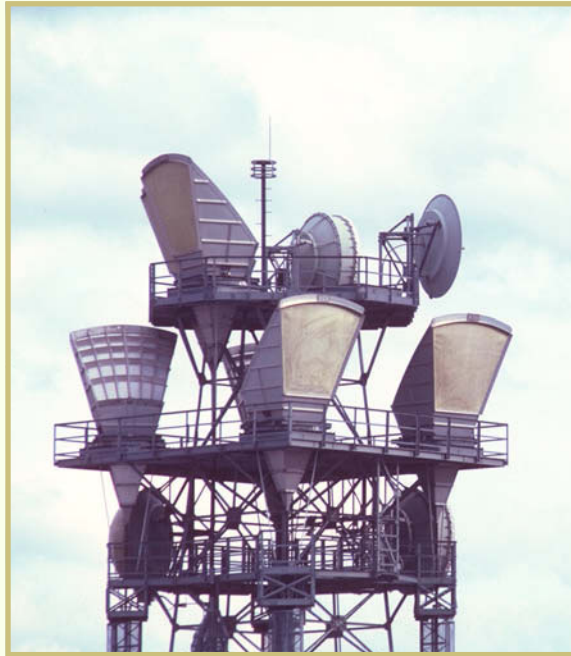
FIGURE 2—The services of many electronic drafters were required to complete the component drawings used when constructing this array of communication equipment.