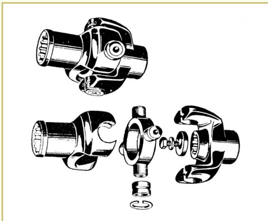
FIGURE 5—A drafter trained in technical illustration created this sales presentation drawing.