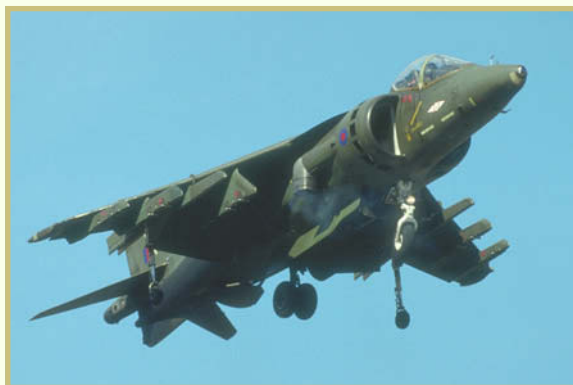
FIGURE 3—The McDonnell-Douglas Corporation employed dozens of tool designers to develop the special tooling required for producing and maintaining this Harrier jet.

Tool designers conceive of the tools, plan out how they would look, and draft the working drawings used to manufacture the tools. Tool and die makers actually build the tools. Tool designers play an important part in most manufacturing plans. The aircraft pictured in Figure 3 is an example of a product that would require the use of special tooling in its production.